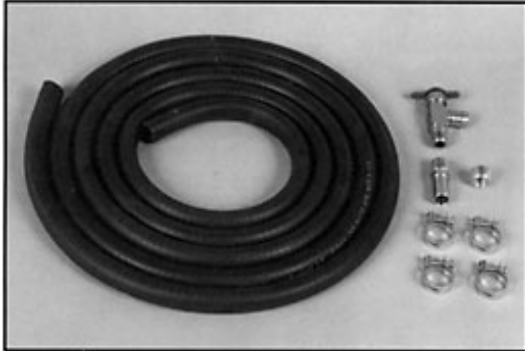
KT-12 Heater Installation Kit Part Number: 64006

This plumbing fittings kit is used to install all heater models listed on this site. The kit contains one 150" heater hose, a water shut off valve, pipe connector, reducer bushing, and four hose clamps.